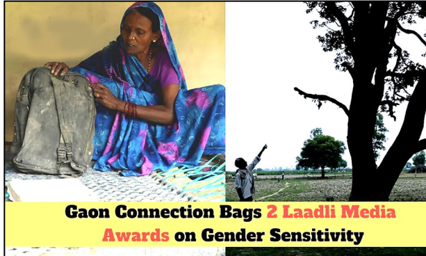
Gaon Connection Bags 2 Laadli Media Awards on Gender Sensitivity